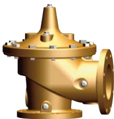
Nickel Aluminum Bronze Main Valve