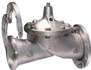
316 Stainless Steel Main Valve